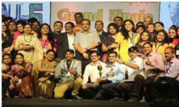
Soul Of Universal At Nesco Ground