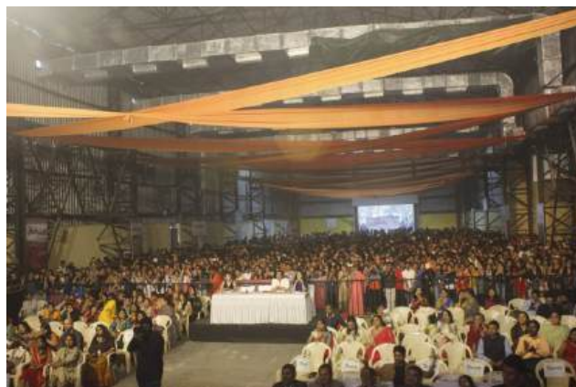
Soul Of Universal At Nesco Ground