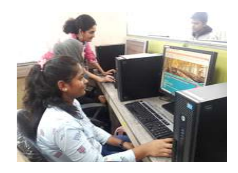
FACULTIES ASSISTING THE STUDENTS IN ONLINE ADMISSION FORM FILLING PROCESS