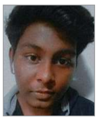
Balla A Hanumanta 9.30 Rank-3<sup>rd</sup>