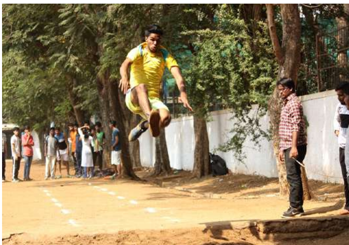
Star Athletes of The Annual Sports Day