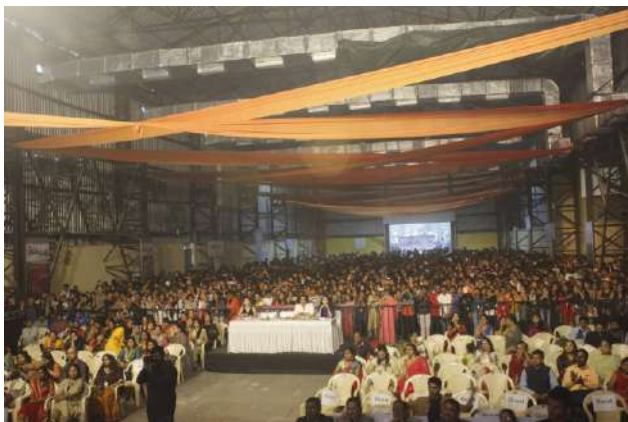
Soul Of Universal At Nesco Ground