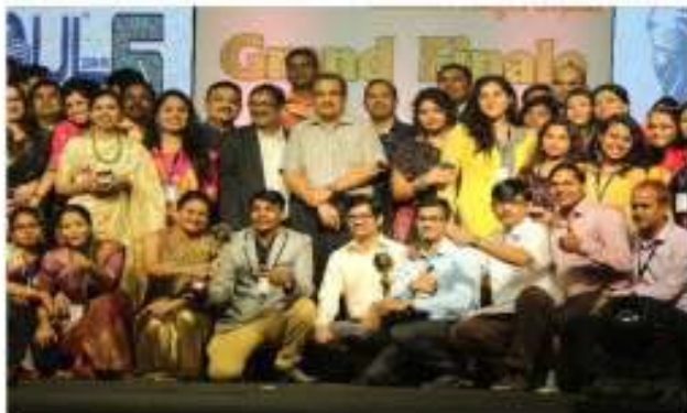
Soul Of Universal At Nesco Ground